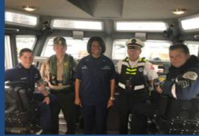
MARITIME SAFETY AND SECURITY