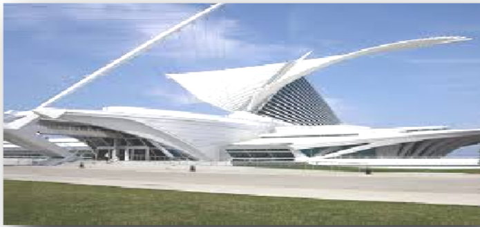
Milwaukee Art Museum

The art culture is a thriving place in Milwaukee. Dive into the creative experience of the finest performing artists at the Marcus Center for the Performing Arts. The Marcus Center presents the best community, symphony, and Broadway performances and programs in the state.