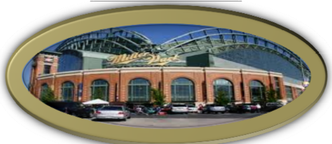
Miller Park (Home of the Brewers)

Milwaukee’s sport teams are always a blast to cheer for and a great activity for the entire family. The three most popular teams include the Brewers (MLB), the Bucks (NBA), and the Admirals (AHL). Also Green Bay is only 3 hours north to watch the Packers (NFL). Remember to check with the USO. From time to time, they offer free tickets for Military. (It’s also possible to attend a game for free and show dedication by volunteering to present colors during the National Anthem.) Ticket information and game schedules are posted on their websites.