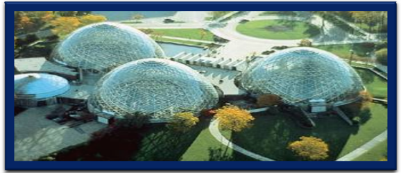
Milwaukee Botanical Gardens