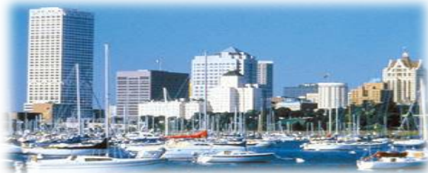
McKinley Marina by Day

City-610,654, County-956,688, Metro-1.7 Million, U.S. 19 th largest city.