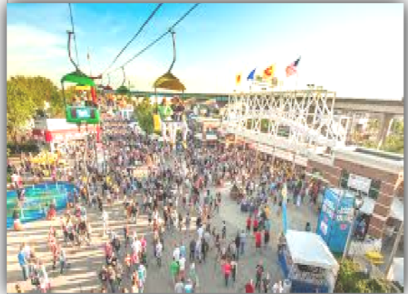
Milwaukee Summerfest Grounds

Milwaukee has been referred to as the “City of Festivals,” which goes without saying. It is home to the “World’s Largest Music Festival;” Summerfest. This annual event consists of 11 straight days in June and July with endless music and entertainment accompanied by great food. Bands from around the nation and the globe take the spotlight on 11 different stages. The various stages satisfy everyone’s musical taste. There are plenty more festivals to enjoy after Summerfest ends. They include: Festa Italiana, German Fest, Brady Street Festival, African World Festival, Arab World Fest, Irish Fest, Mexican Fiesta, Pride fest, and many more. We take pride in celebrating our cities diversity.